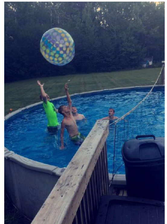
Our Snapchat reveals that the After The Fair Pool Party was a fun success!

We will be having some after-fair stress relief in the form of paintballing. Join us on August 7 from 8am-12pm , at Battlefield Paintball . It is sure to be a blast!