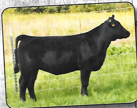
Shorthorn Plus Heifer

VIEWING STARTS - 3:00 PM - SALE STARTS - 5:00 PM