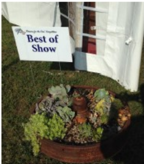
Russell Corner Badgers 4-H Club

We had 8 wonderful entries! The Master Gardener's graciously volunteered to judge the displays again this year. They looked at overall creativity, health of the plants and arrangement of display. Each club received a certificate of participation. Below are the results,