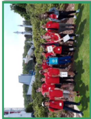
Space Camp delegates explore the U.S. Space and Rocket Center in Huntsville, Alabama.