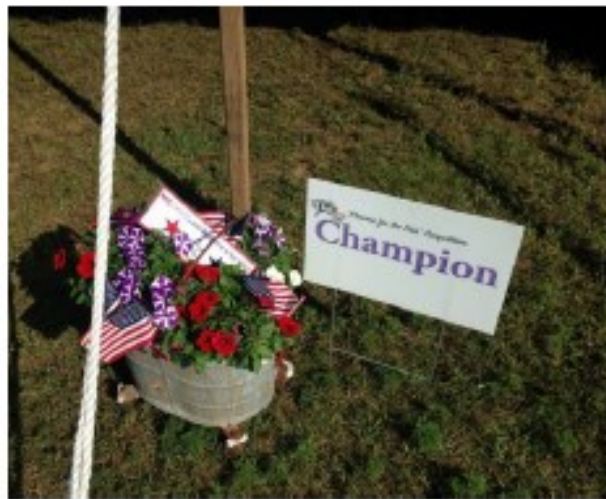
Pleasant Valley 4-H Club