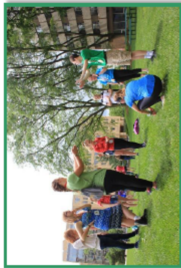
Delegates participate in welcome activities at WI 4-H & Youth Conference.