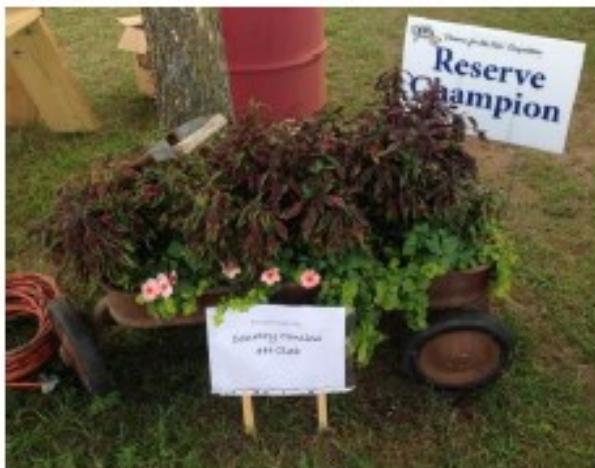
Country Cousins 4-H Club