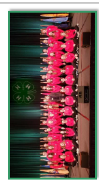
National Congress delegates on stage at the Hyatt Regency Hotel in Attanta, GA.