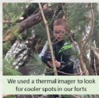
We used a thermal imager to look for cooler spots in our forts