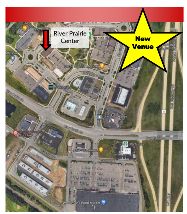
River Prairie Center 1445 Front Porch Pl, Altoona, WI 54720