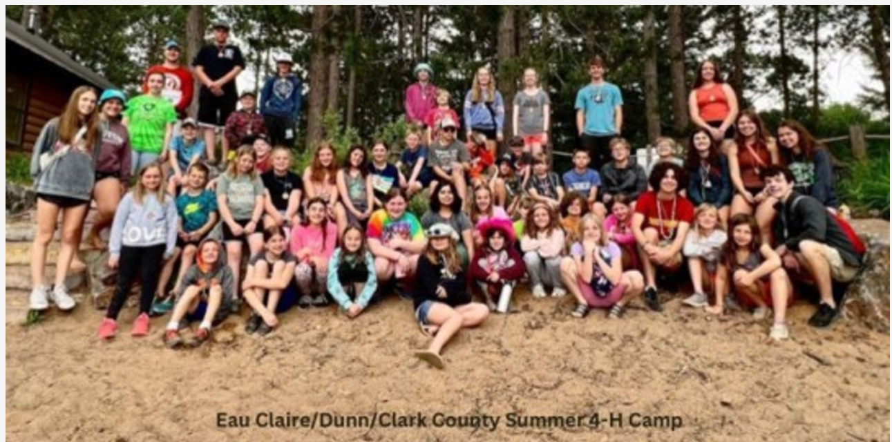
Eau Claire/Dunn/Clark County Summer 4-H Camp