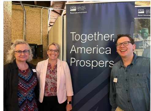
Colleagues interested in increasing rural housing gather for a photo at the Rural Partners Network Workshop, in Rothschild, Wisconsin on June 13, 2024.

I attended the County Officials Workshop Sponsored by the Local Government Education Program of UW-Madison Division of Extension and Wisconsin Counties Association.