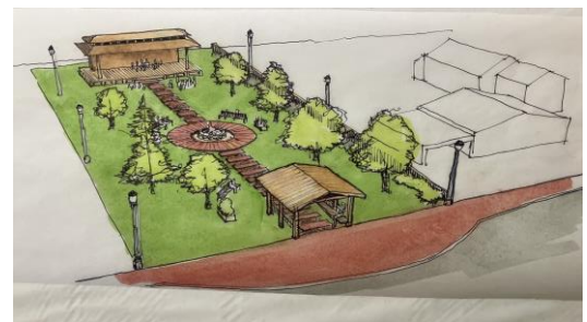
A design for Chat-A-While Park in Fairchild that incorporates the community's railroad heritage.

A Strategic Planning process for the Eau Claire County Criminal Justice Collaborating Council (CJCC), where seated members completed individual interviews, and participated in a three-part workshop series to affirm the purpose, establish goals, and develop work plans to achieve them. Through this effort, the CJCC will build its organizational capacity to address pressing issues in the criminal justice system and enhance the efficacy of the system to build safer and more just communities.